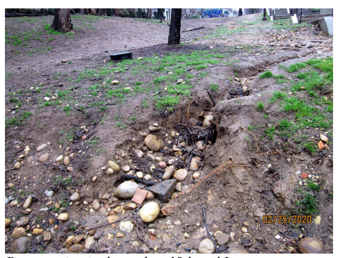
Deep erosion in the park at 19th and Lamont

That project has been under review since 2010. Some of the nearby residents hate the thought of anything being built on that difficult lot. Others agree, though, that the property owner has a right to build on the lot, much as they might prefer the lot be left undeveloped. Some have said that they would welcome a large house being built on the lot, something matching the single-family houses on 17th, rather than the row houses proposed. But the area is zoned for row houses, the style most characteristic of Mount Pleasant. The property owner has reduced the size of the proposed structure from three row houses to two.